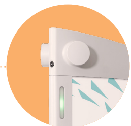
Front & Rear Situational Awareness Cameras